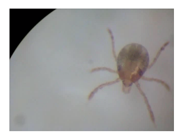
Fig 4: Hyalomma marginatum larvae in feeding posture