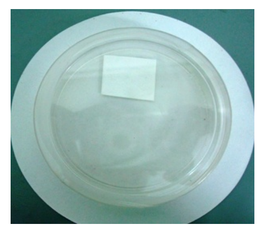
Fig 2: Petridish bioassay

response is to specific olfactory stimulation. Since no work has been done on H. bispinosa which is predominantly a small ruminant tick it is assumed that propionic acid stimulating 57 % positive response from the tick larvae would be used to attract H. bispinosa larvae. The combination of butyric and propionic acid was ineffective in attracting substantial number of larvae. The dog tick R. sanguineus was also exposed to the ruminant volatile fatty acid (s) and as expected it did not respond to any of the volatile fatty acid or their combinations since these are specific to ruminants.