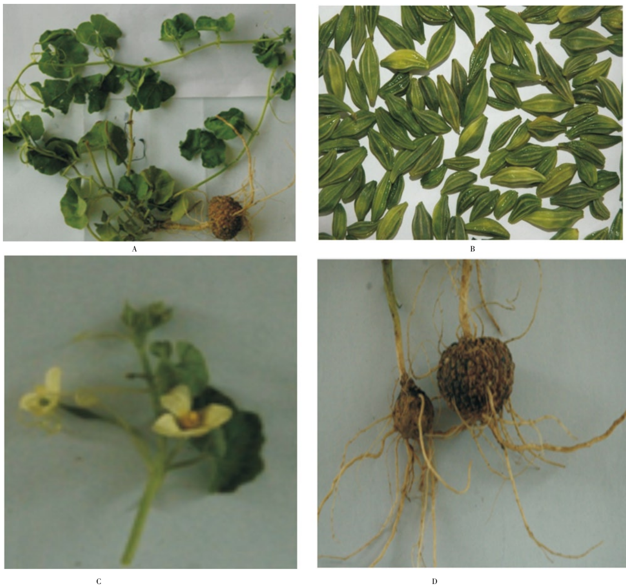
Figure 1. Momordica cymbalaria . (a) Leaves, (b) Fruits, (c) Flowers, (d) tubers of Momordica cymbalaria .

The nutrient contents of the two vegetables M. cymbalaria (athalakkai) and Momordica charantia (bittergourd) are summarized in Table 1. The calcium content of athalakkai is three times higher than that of the bitter gourd. Calcium is required for the growth of bones and teeth as well as for maintaining normal heart rhythm, blood coagulation, muscle contraction and nerve responses. The higher concentration of this nutrient in athalakkai may be exploited and used. Iron content in both the vegetables is almost the same. The ascorbic acid (Vitamin C) content of athalakkai is two times higher than that of bitter gourd. This is of interest, where there is shortage in vitamin C consumption. The content of potassium in athalakkai is also two times higher than in bitter gourd. The \beta carotene content in athalakkai is negligible[3]. The results of phytochemical analysis of the leaves and tubers of athalakkai were shown in Table 2 and