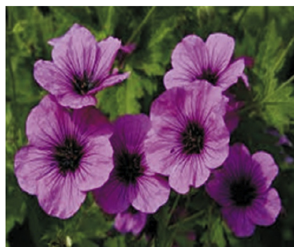
Figure 3. Pelargonium graveolens L' Herit.

Geranium ( Pelargonium graveolens L' Herit) belongs to the family of Geraniaceae (Figure 3). A perennial hairy shrub native