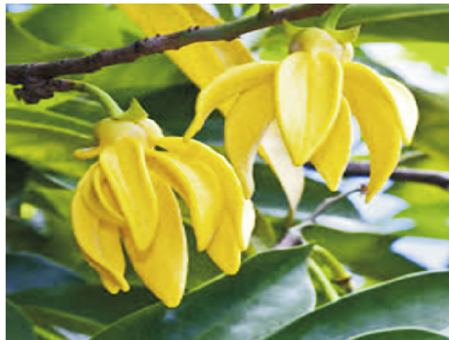
Figure 10. Cananga odorata Hook. F. & Thoms.

farnesol, benzyl acetate, geranial, methyl chavicol, beta-caryophyllene, eugenol, pinene and farnesene. The best property of this tree is to retard the heart beat and rapid breathing with perfect use in shock and trauma situations. It is anti-depressive in nature with euphoric properties [5], thus giving the feeling of well being. Low self-esteem and women suffering from the post-menopausal syndrome have better results on them. A pilot study involving 34 professionals from a nursing group was carried out in Portugal to verify the use of ylang ylang essential oil in relieving the anxiety and increasing the self esteem along with alteration of blood pressure and temperature. The results showed clear evidence that use of this plant led to a significant alteration in self esteem [74]. Further, its aphrodisiac properties are due to its exotic fragrance advantageous for both dry and oily skins. It is also indicated in depression, anxiety, hypertension, frigidity, stress and palpitations [75].