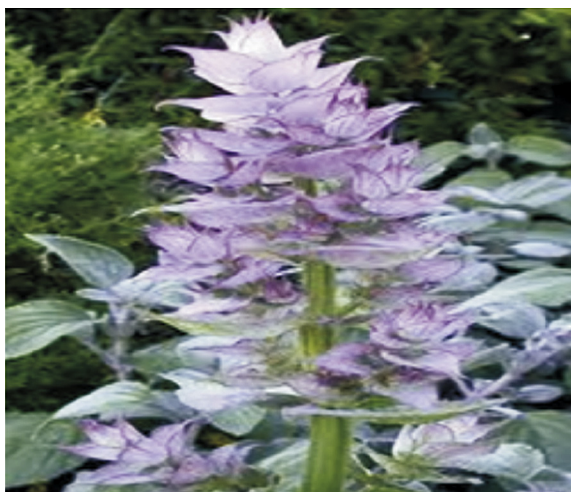
Figure 1. Salvia sclarea Linn.

Eucalyptus [ Eucalyptus globulus Labill ( E. globulus )] belonging to the family of Myrtaceae, is a long evergreen plant with a height up to 250 feet (Figure 2). It is known for its