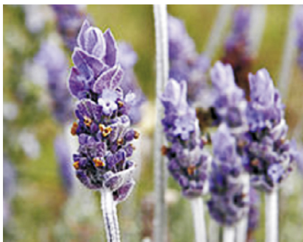
Figure 4. Lavandula officinalis Chaix.

Lavender ( Lavandula officinalis Chaix.) belonging to the family of Lamiaceae, is a beautiful herb of the garden (Figure 4). It contains camphor, terpinen-4-ol, linalool, linalyl acetate, beta-cimene and 1,8-cineole [38]. Its constituent varies in concentration and therapeutic effects with the different species. Linalool and linalyl acetate have maximum and great absorbing properties from skin during massage with a depression of central nervous system. Linalool shows sedative effects and linalyl acetate shows marked narcotic actions. These two actions may be responsible for its use in lavender pillow anxiety patients with sleep disturbance pattern, improving the feeling of well being, supporting mental alertness and suppressing aggression and anxiety [53]. Lavender oil shows its antibacterial and antifungal properties against many species of bacteria, especially when antibiotics fail to work, but the exact mechanisms are yet to be established. When talking about its use in aromatherapy, it is