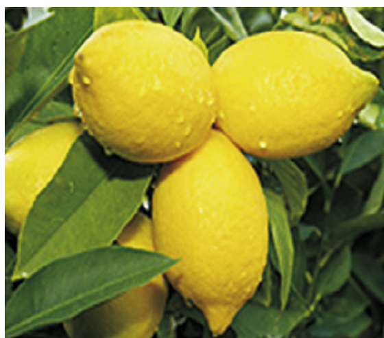
Figure 5. C. limon Linn.

Peppermint [ Mentha piperita Linn. ( M. piperita )] belongs to the family of Lamiaceae (Figure 6). Till date, all the 600 kinds of mints are raised from 25 well-defined species. The two most important are peppermint ( M. piperita ) and spearmint ( Mentha spicata ). Spearmint bears the strong aroma of sweet character with a sharp menthol undertone. Its oil constituents include carvacrol, menthol, carvone, methyl acetate, limonene and menthone. The pharmacological action is due to menthol, a