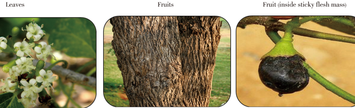
Flowers Figure 1. Parts of C. dichotoma plant.