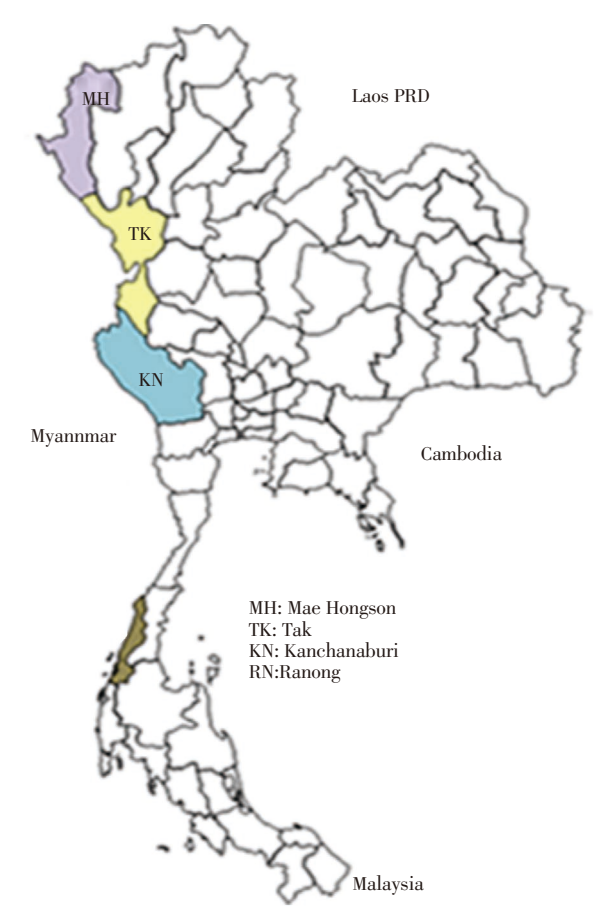
Figure 1. Map of Thailand presenting the four malaria endemic areas along the Thai–Myanmar border.

A total of 172 P. falciparum -infected dried blood spot samples were collected prior to treatment, from patients with acute uncomplicated P. falciparum malaria during 2009–2010 from the four malaria endemic areas along Thai-Myanmar border of Thailand, i.e. , Mae Hongson (MH, 41 samples), Tak (TK, 82 samples), Kanchanaburi (KN, 6 samples) and Ranong (RN, 43 samples) provinces (Figure 1). Genomic DNA was extracted from each sample using chelex resin according to the previously described method<sup>[11]</sup>.