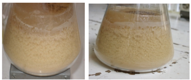
Figure 2. Preparation of brebra defatted flour agar below pH 6.5.

The pH of the agar and broth medium of defatted brebra seed flour should be adjusted from 7 to 7.2. Otherwise the entire medium substances will precipitate at pH value less than 6.5 (Figure 2).