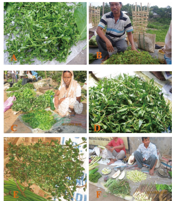
Figure 2. Selling different ethnomedicinally important hydrophytes by local tribal community.

are important because of its role in bones, teeth, muscles system and heart functions [23].This is followed by K, which was present in amount ranging from 8.77 ppm ( Ipomea aquatica ) to 3.36 ppm ( Hygrophila auriculata ). K is important in for its diuretic nature and Na plays an important role in the transport of metabolites. The ration of K/Na in any food is an important factor in prevention of hypertension arteriosclerosis, with K depresses and Na enhances blood pressure. The ration of K/Na is significant in Neptunia prostrata (27), Centella asiatica (6.8), Ipomea aquatica (5.51), and compared with leafy vegetables (Cabbage 17.5, beet 3.9). The Mg content of the studied plant taxa varied from 2.14 ppm ( Bacopa monnerii ) to 3.77 ppm ( Alternanthera philoxeroides ). In humans, Mg is required in the plasma and extracellular fluid, where it helps in maintaining osmotic equilibrium. It is required in many enzyme –catalysed reactions, especially those in which nucleotide participate where the reactive species is the magnesium salt, e.g., MgATP 2- .Lack of Mg is associated with abnormal irritability of muscle and convulsions and excess Mg with depression of the central nervous system.