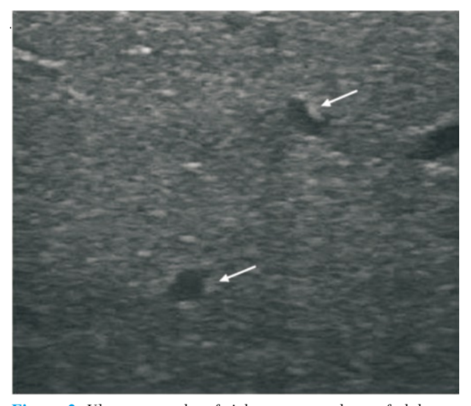
Figure 2. Ultrasonography of right upper quadrant of abdomen showing multiple cystic lesions with eccentrically located scolices inside the cysts.