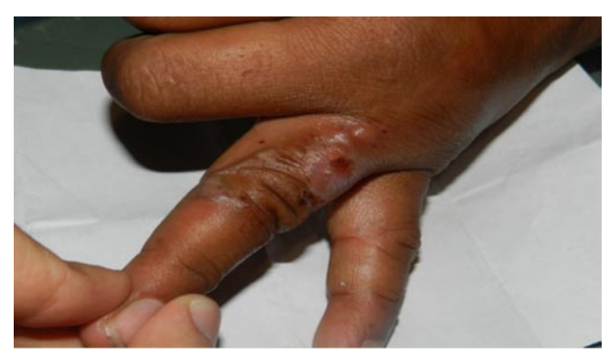
Figure 1. Photograph of lateral aspect of the left annular finger showing serpiginous lesion in skin.

admitted in our medical office of the Cristobal Colon University, for present pruritic, painful cutaneous lesions, which had been progressing for 1 week. The physical examination revealed a serpiginous lesion in skin, with vesicles in the lateral region of the left annular finger (Figures 1 and 2). This patient was found to present with signs and symptoms of diabetes mellitus. There was no eosinophilia in the blood count, the glucose was increased and there was glucosuria and proteinuria in the urinalysis. The patient was treated with oral albendazole (400 mg per day for 7 d) and dicloxacillin (500 mg every 8 h for 8 d) for secondary infection signs.