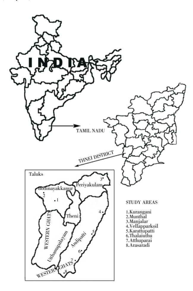
Figure 1. Location map of Theni district in Tamil Nadu, India.

Theni District lies at the foot of Western Ghats and is situated between 90° 53′ and 10° 22′ north latitude and 77° 17′ and 77° 67′ east longitude (Figure 1). The general geographical information of the district is diversified by several ranges and hills. The vegetation is classified as southern tropical forests in the plains and foot hills, dry deciduous forests, moist deciduous forests and evergreen forests in the high altitudes. In the present study, ethnobotanical surveys were carried out in the following Paliyar and Muthuwar villages of Theni District: Kurangani ( Muthuwars ), Arasaradi/Notchioodai, Attupparai/ kathrikaparai, Karattupatti, Manjalaru, Munthal, Thazhaiuthu and Velapparkovil (Paliyars).