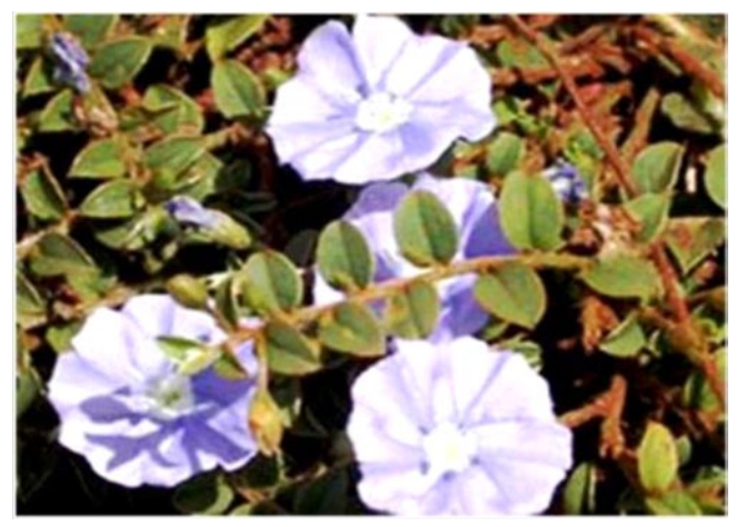
Figure 1. C. pluricalis.

Figure 1 shows the profile of this plant, and the synonyms of this plant include C. pluricaulis and C. microphyllus [7].