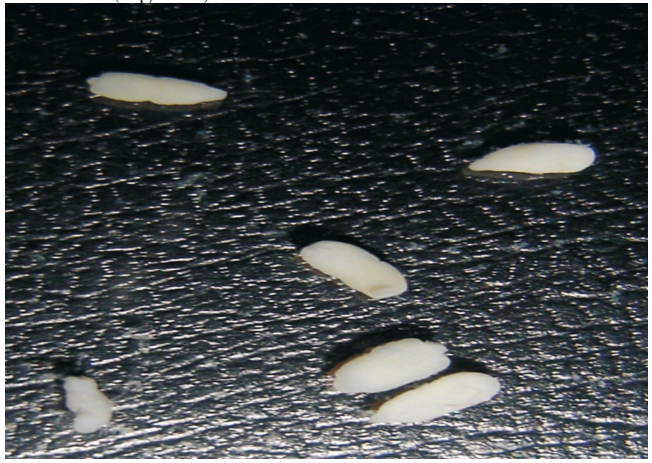
Figure 1. D. caninum proglottids.

and no history of nutritional deficience. The six specimens were macroscopically studied. The structures resembled proglottids of a tapeworm when observed under a hand lens. Each proglottid segment was about 8–9 mm long and 2–3 mm thick (Figure 1).