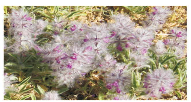
Figure 1. Aerial plant of S. lavandulifolia Vahl (Lamiaceae).

The inflorescences (0.05-0.10 kg) of wild populations of S. lavandulifolia Vahl were collected at the early flowering stage on 1–20 June 2010 (During 20 day's period). The samples of the plants were identified by regional floras and authors with floristic and taxonomic references[3], and voucher specimens were deposited at the Herbarium of Agriculture and Natural Resources Researches Centre of Chaharhal va Bakhtiari province, Iran (No.: SHK 2164) (Figure 1). Harvested inflorescence was shade dried at room temperature for one week and ground into a powder. Air-dried and ground (50 mesh) plant material was subjected to hydro-distillation (1000 mL distillated water) for 2 h using a Clevenger-type apparatus according to the method recommended in British pharmacopoeia<sup>[29]</sup>. Samples were dried with anhydrous sodium sulphate and kept in amber vials at 4 °C until chromatographic analysis.