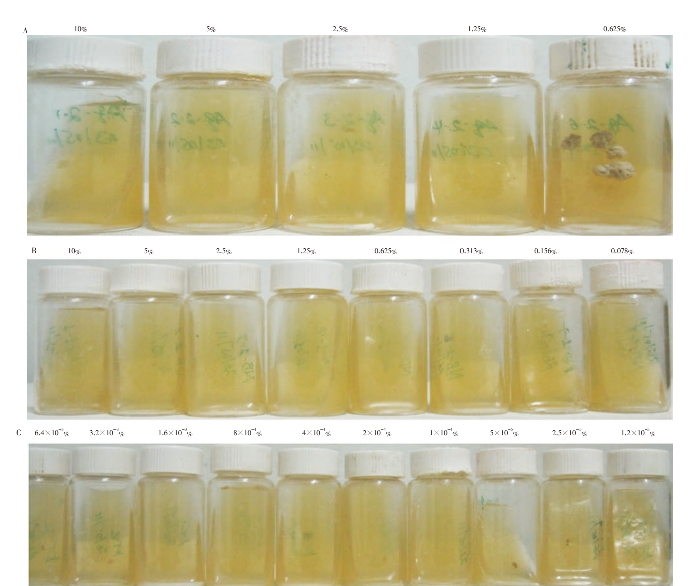
Figure 2. MFCs of aqueous and n -butanol extracts of P. dodecandra against HCF. A: MFC of aqueous extract; B: MFC of n -butanol; C: MFC of the positive control (ketoconazole).

4 in early stage and 6 in moderate stage. No significant difference in the degree of response to treatment was observed between early and moderate cases ( \chi^2 = 0.686 , OR=2, 95% CI=0.384-10.409, P=0.408).