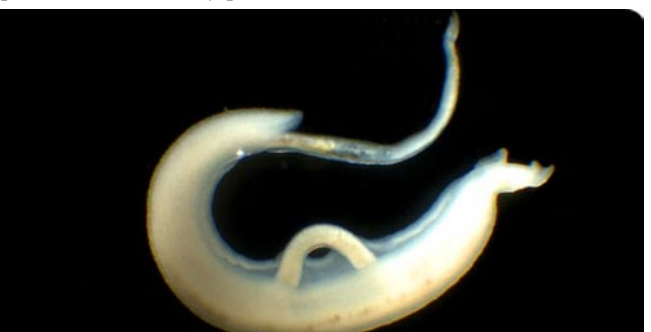
Figure 1. Schistosoma parasite.

Skin is the initial organ of contact where the parasite makes its first hideout and then transforms into another stage (schistosomula). Lungs and liver are the next area of migration, where it matures into the adult form. The adult worm then moves to specific body part depending on its species and sub-species. These areas include the bladder, rectum, intestines, liver, portal venous system (the veins that carry blood from the intestines to liver), spleen, and lungs. Schistosomiasis is not usually seen in countries like United States. It is often found in many tropical and subtropical areas worldwide[2]. Figure 1 illustrates the developed adult parasite and its body parts.