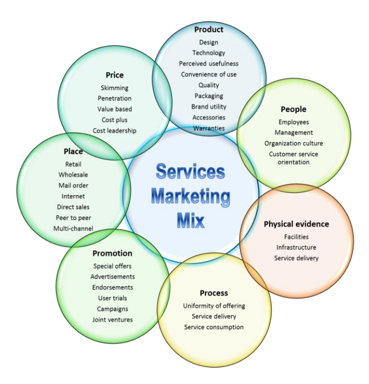
Fig. 1. 7 Ps of services marketing (The 7 Ps of services marketing, Business fundas, 2010)

Thus, marketing goal is to meet consumer needs by using marketing mix components in the best way. The figure below shows how marketing influences demand and supply of the service.