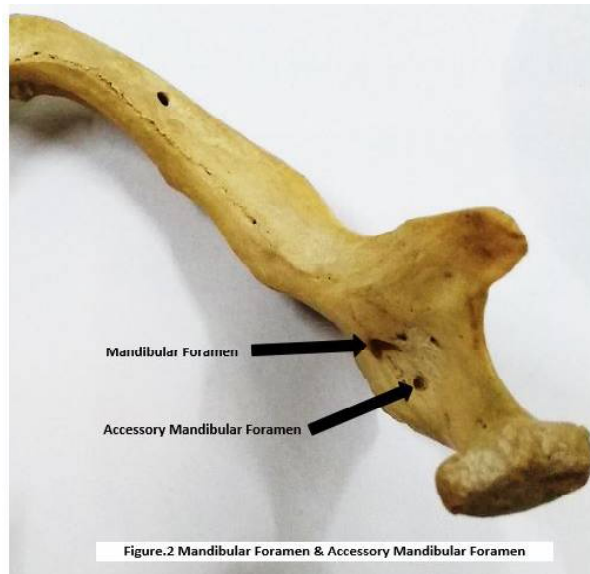
Fig. 2: Showing the mandibular and accessory mandibular foramen.