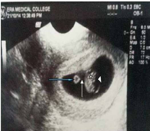
Fig. 2: Showing sonographic measurement of inner YSD.

Fig. 1: Showing ultrasonographic picture of Gestation sac (pink arrow), amniotic sac (arrow head), yolk sac (blue arrow), developing embryo (star) and vitelline duct (white arrow).