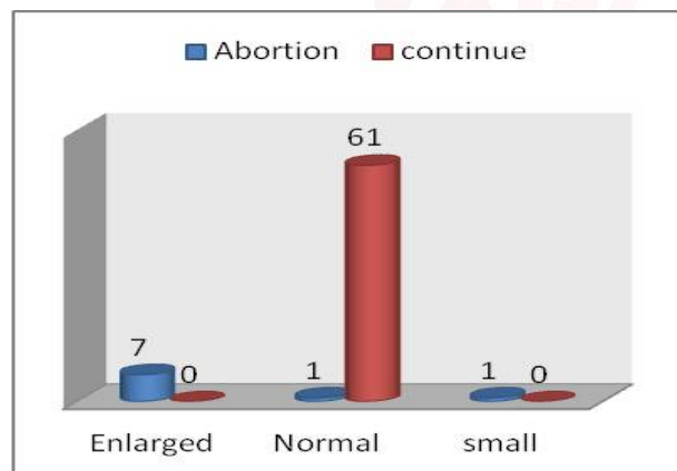
Graph 2: Bar graph showing distribution of yolk sac size with gestation outcome.