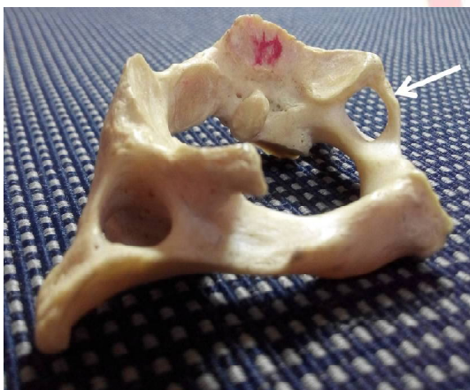
Fig. 1: Atlas vertebra showing right sided complete ponticulus posterior.