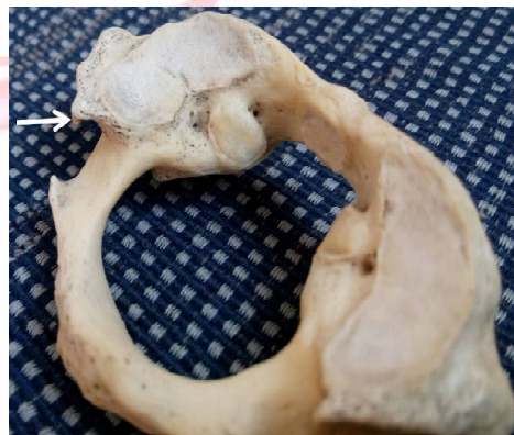
Fig. 5: Atlas vertebra showing bilateral incomplete ponticulus posterior.