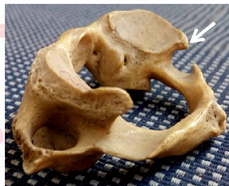
Fig. 4: Atlas vertebra showing left sided incomplete ponticulus posterior.