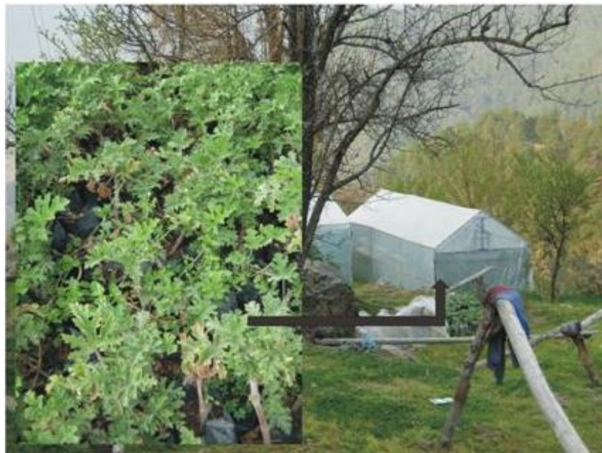
Figure 1. Medicinal plant ( Geranium ) grown in the poly-houses in a bio-village near Gwaldom.

were given to interested native farmers of the region. They were provided financial assistant to grow MPs in the poly-houses. There are thousands of medicinal species found mostly in the mid-altitudes and the highlands. The State Forest Department claims to have knowledge of about 175 species, which are being commercially extracted and traded. However, the State could not harness the available species of MPs optimally. According to estimation, about Rs. 100 million (Rs. denotes the Indian currency) can be generated per annum through this practice.