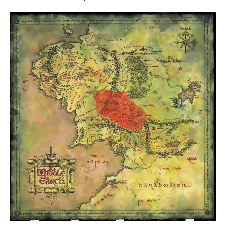
Annex 2 – The Hobbit Coins and Stamps