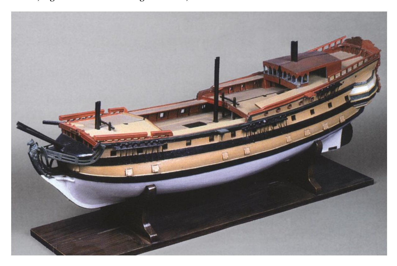
Figure 2. The photo of the Ejder Başlı/Leontii Muchenik's exquisite dockyard model, currently in the collections of the Central Naval Museum in St. Petersburg. This model was for long tought to represent the Semend-i Bahri», a similar 60-gunport ship captured at the battle of Chesma and renamed as «Rodos» by the Russians