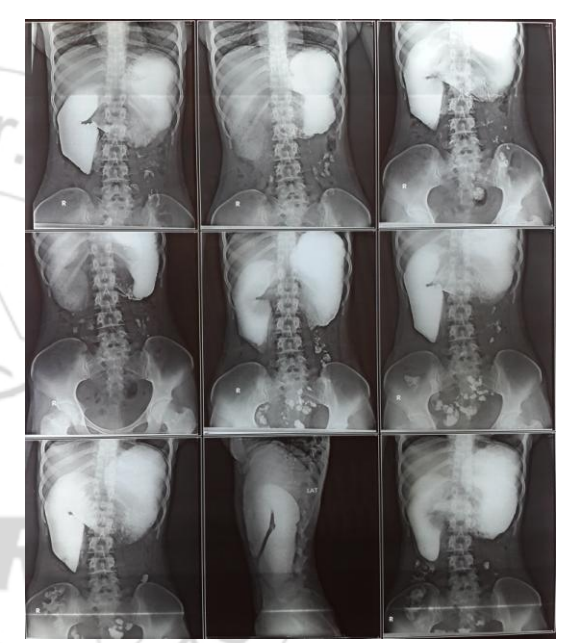
Figure 1: CECT abdomen showing dilated duodenum

Her vitals were stable. Abdominal examination revealed epigastric fullness and hyper peristaltic bowel sounds. Routine blood and urine examination were normal. Monteux and erythrocyte sedimentation rate (ESR) test were negative. Ultrasonography (USG) of the abdomen was normal. Upper gastrointestinal barium study showed dilated stomach with dilated second part of the duodenum and cut off at the third part of duodenum. There was no relief of obstruction in the left lateral decubitus or prone position. Contrast enhanced computed tomography (CECT) showed distended stomach with dilatation of second part and constriction/extrinsic compression of the third part of duodenum between aorta and SMA (figure 1 and figure 2).