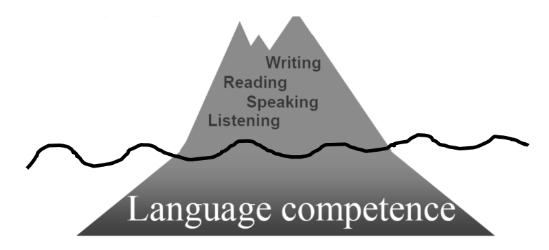
Figure 1: Observable and unobservable language abilities (Schellekens, 2007) Research Methodology

The language ability of a learner determines and is influenced by his/her skills development. This implies that the learning load is heavier for low ability learners when it comes to skills development and the priorities may also be different.