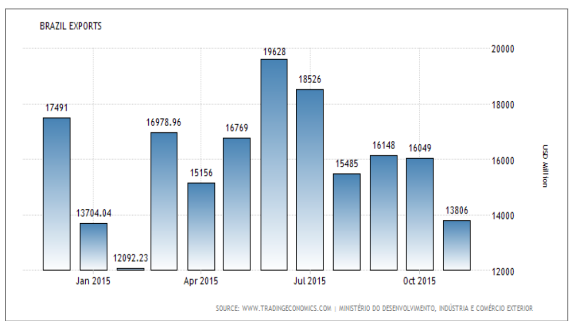
Figure 3: Brazilian Exports

Brazil's exports fell 11.8 percent year-over-year to 13806 USD Million in November of 2015 injured by a sharp crashes of commodity prices, including iron ore, soybeans seeds and oil, that composed around half of shipments. Exports in Brazil averaged 4364.63 USD Million from 1954 until 2015 (Trading Economics, 2015).