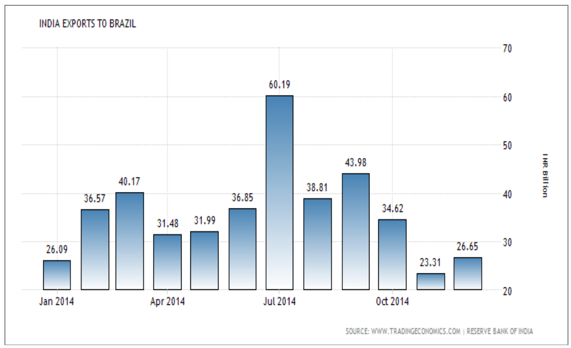
Figure 4: Indian Export to Brazil

As Reserve Bank of India reported, Indian exports to Brazil increased by 26.65 INR Billion in December from 23.31 INR Billion of November, 2014. Indian exports to Brazil averaged 7.06 INR Billion from 1991 until 2014 (Trading Economics, 2015).