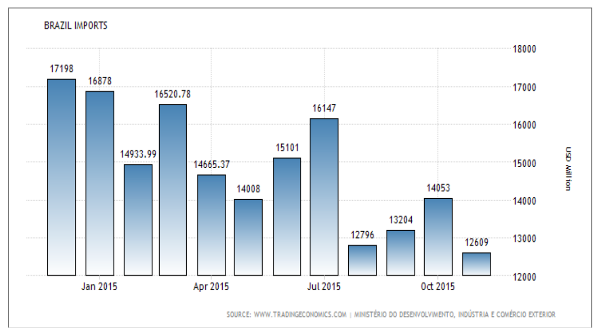
Figure 2: Brazilian Imports

Imports of Brazil reduced by 30 percent year-over-year to 12609 USD Million in November of 2015 as weak real has been pushing cost of imported commoditites privileged and consumer spending remains weak. Imports of Brazilian market averaged 4083.08 USD Million from 1959 until 2015 (Trading Economics, 2015).