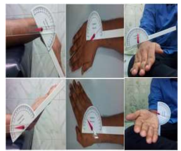
Fig. 3: Wrist ROM for the similar patient showing good ROM score of 22 out of 26

Also we found dorsal tilt has great impact on functional objective outcome and should be restored adequately, the similar results were shown by the study conducted by Forward et al<sup>18</sup>; but there is no relation with radial inclination.