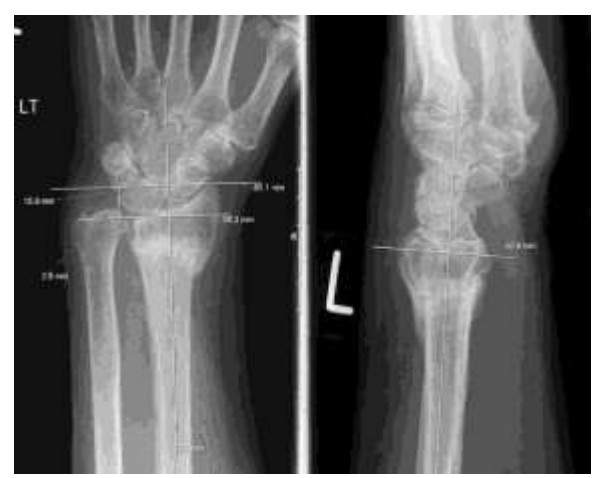
Fig. 2: AP and Lateral x-ray of malunited fracture showing radiological parameters of 61 year old patient

that the anatomical restoration results in better functional outcome in young groups, but not in older age group patients.