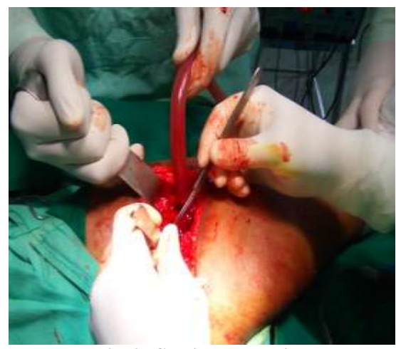
Fig. 2: Continuous suction