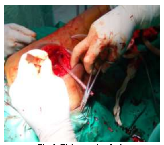
Fig. 3: Fixing suction drain