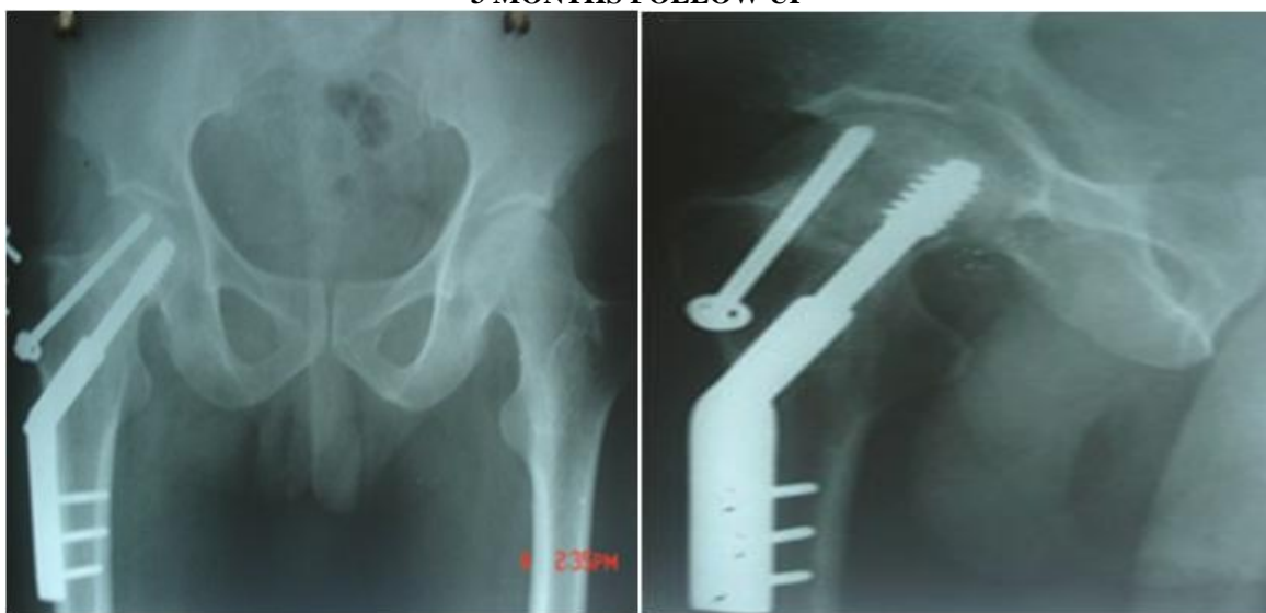
3 MONTHS FOLLOW UP