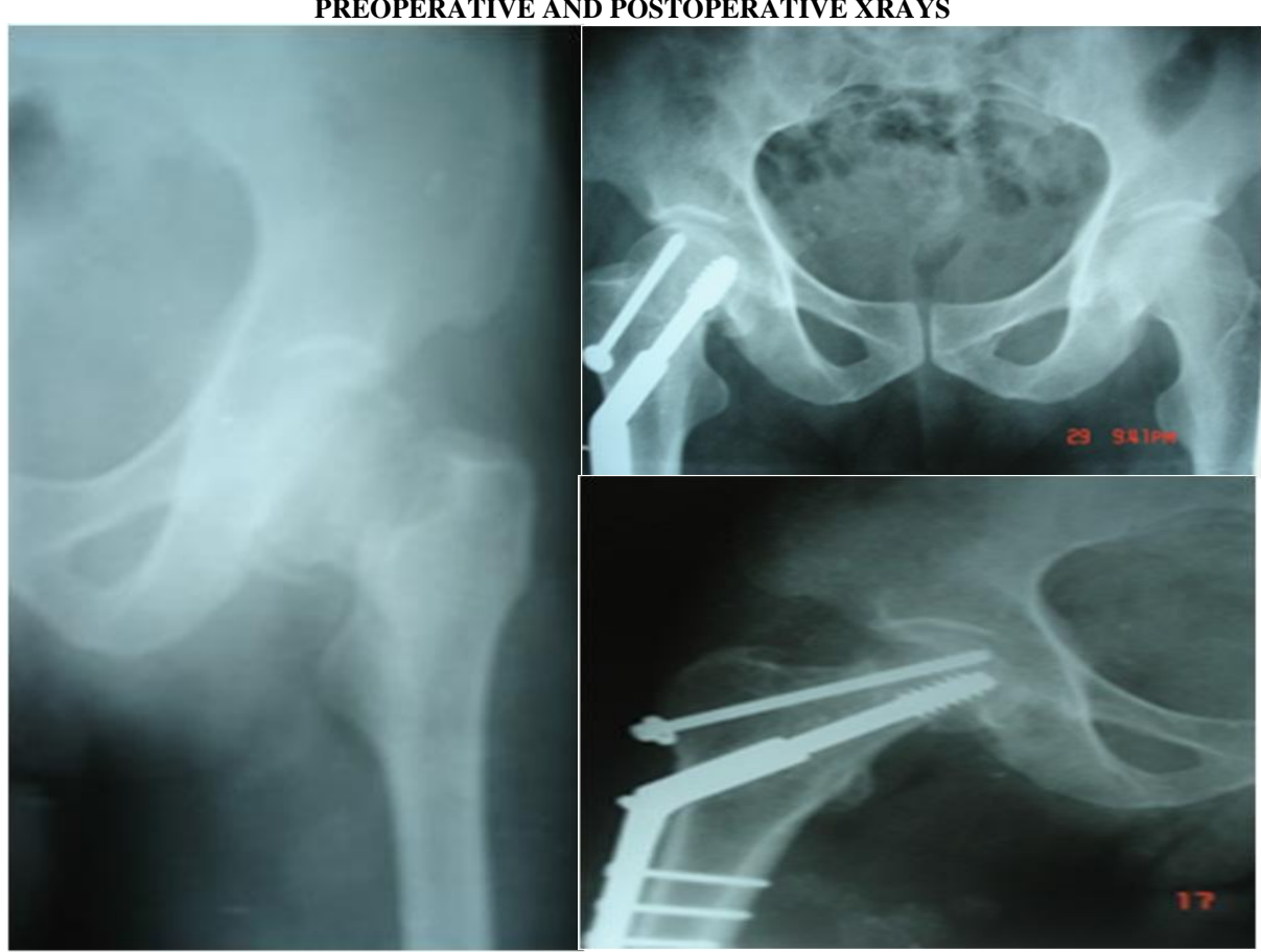
PREOPERATIVE AND POSTOPERATIVE XRAYS