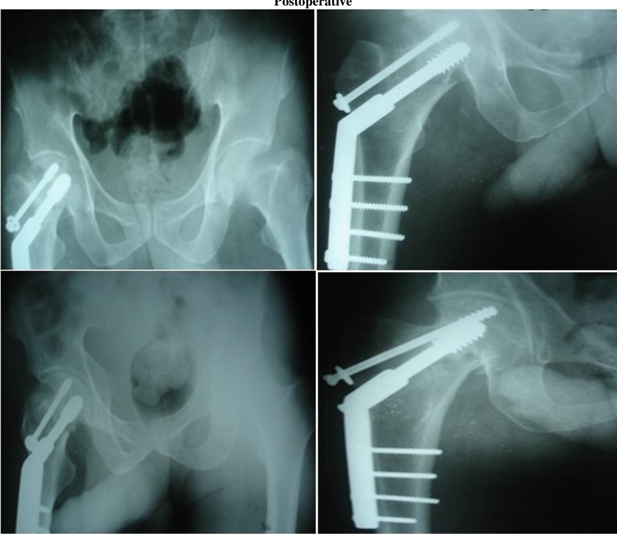
Immediate Post-Operative [Osteosynthesis with DHS and Derotation Screw Done and 3 Months Postoperative