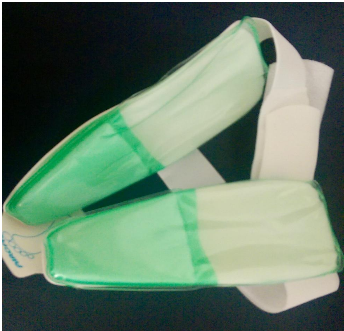
Fig. 2: Air-stirrup ankle support