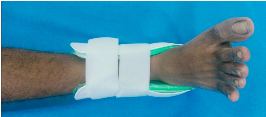
Fig. 3: Air-stirrup ankle support