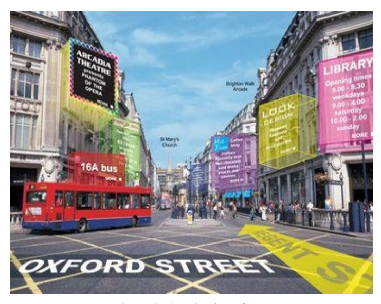
Figure 1: Application of AR