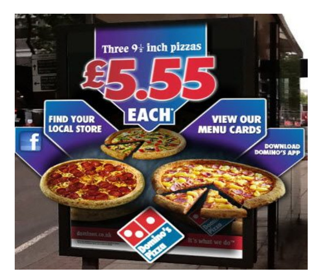
Figure 2: AR for Printing and Publishing