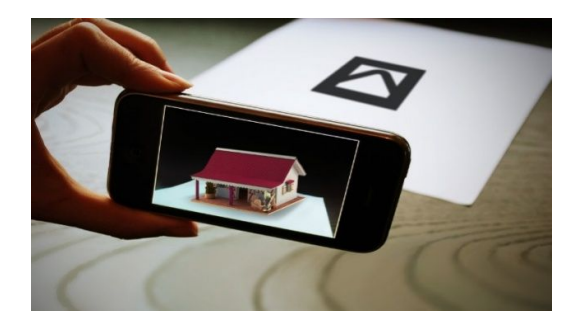
Figure 7: Marker Based AR

AR markers are images detected by camera and which can be linked with software as the location for virtual assets. Colors can be used as long as the contrast between them is recognized by camera, mostly black and white are used. Simple AR markers can be of more than one shapes made up of black squares against white background[9]. A camera with AR software is used to detect AR markers for location. The image can be viewed on a screen and digital assets are placed into the scene at the place of markers. Limitations on types of AR markers that can be used are based on software that recognizes them. The simplest type of augmented reality markers are mostly black and white 2D barcodes.