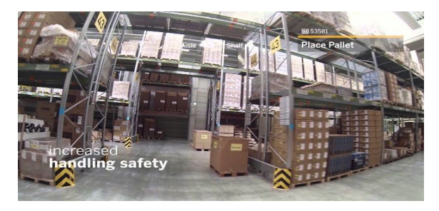
Figure 4: Warehousing Operations