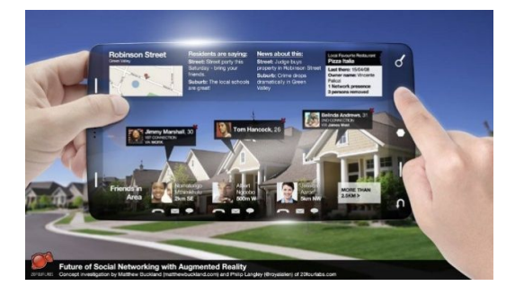
Figure 8: Marker Less Based AR