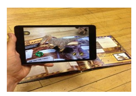
Figure 3: AR for Books

AR technology inside books can help to create a virtual story which will be easy to understand by the user and to create immersive reading experiences. Possible applications: