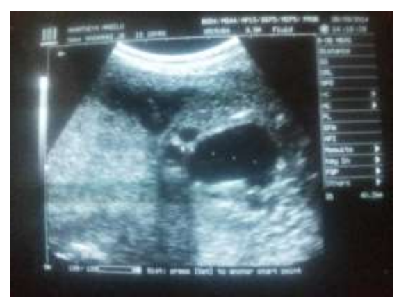
Fig. 3: USG of ICM