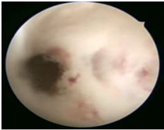
Fig. 2: Right ostium occluded by adhesions