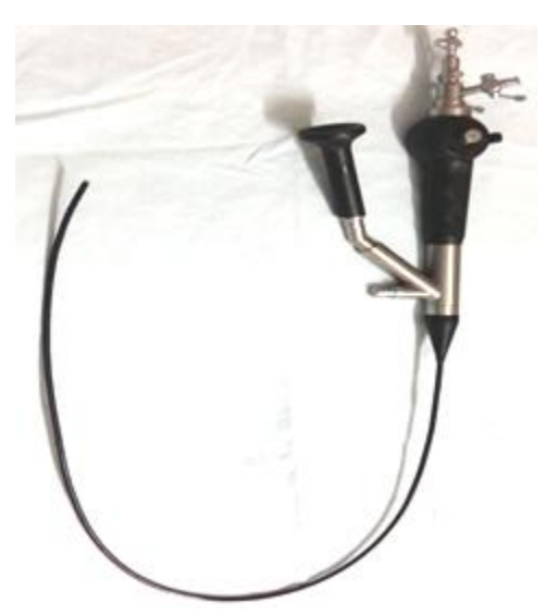
Fig. 2: Flexible fiberoptic ureteroscope.