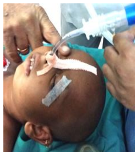
Fig. 4: Urethroscope guided 4.5 sized nasotracheal tube. Also note the retrognathia