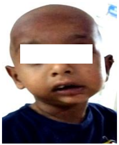
Fig.: 1 Left Temporomandi bular joint ankylosis with deviation of mandible to left and retrognathia