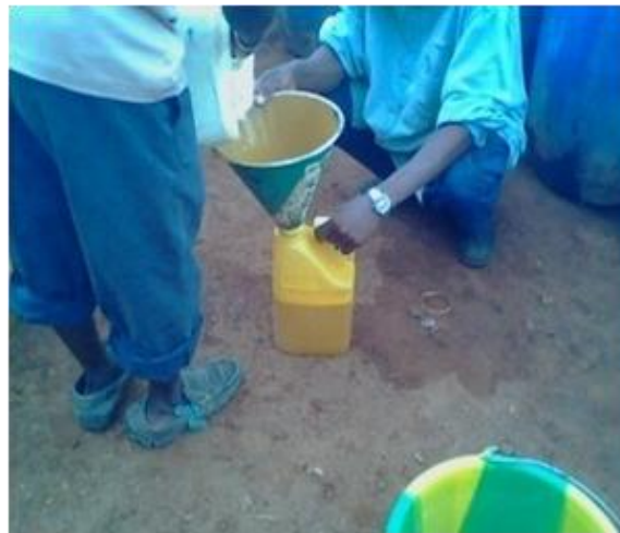
Photo 2. Operators handling pesticides without protective equipment

kits chemical reagents laboratories SOBIODA (TGP- monoreagent ALT, AST monoreagent - TGO) Spinreact (cholinesterase), Erba Mannheim (creatinine) and Cypress ( \alpha -amylase).