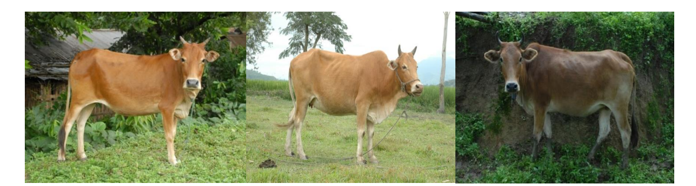
Figure 3. Indigenous cattle of Tripura

The considerable variation in body dimensions of the three cattle populations might not be unconnected with individual population potential and peculiarities. The minimum and maximum variability was observed in horn length and ear length, respectively. The estimates of body length obtained in the present study were in agreement with the reports of Pundir et al. (2013) in Uttara cows, Pundir et al. (2012) in Pithoragarh cows and Pundir et al. (2009) in Bargur cows. However, higher estimates of body length were observed by Singh et al. (2012) in Pullikumam cows, Pundir et al. (2011) in Kankrej cows and Pundiret al. (2007) in Kenkatha cows. The estimates of height at wither. heart girth and paunch girth were comparable with the reports of Pundir et al. (2012; 2013). Higher estimates of height at wither were reported by Singh et al. (2012), Pundir et al. (2007; 2011).