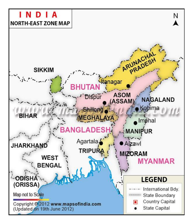
Figure 1. North East zone of India