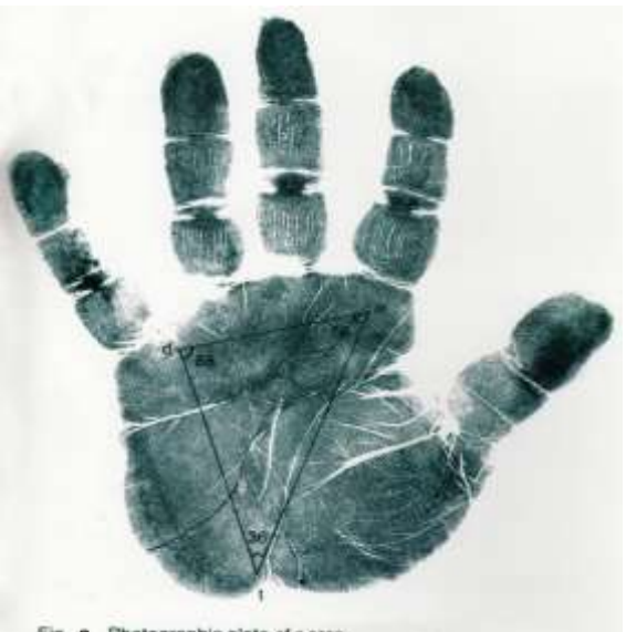
Photographic plate of a case

the "p" value was <.001, which is significant. So, angles adt and angle atd can be used as a reliable data for assessing the diabetic cases by Dermatoglyphics.