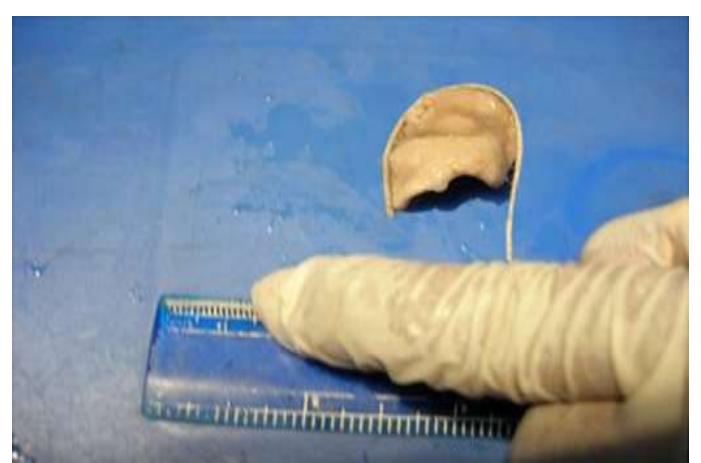
Fig. 1: Measurement of the length of the adrenal gland using a thread and ruler