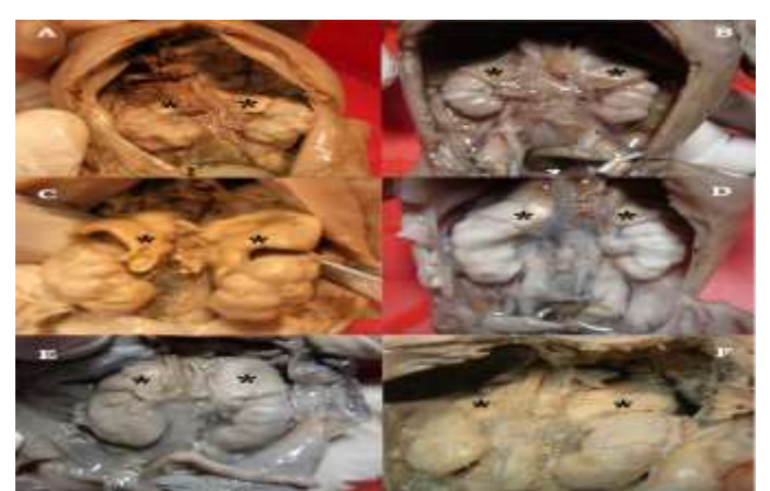
Fig. 2: Dissected fetal abdomen showing the suprarenal glands (*) in various gestational ages. A–14weeks, B– 16weeks, C–20weeks, D–24weeks, E–26weeks, F–30weeks. Note the predominant tetrahedral shape of the right and crescentic shape of the left suprarenal glands