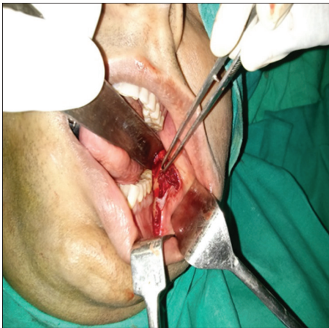
Figure 1: Intra oral incision