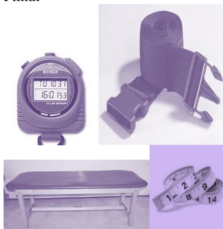
Figure 1: Instruments