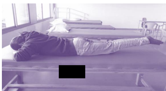
Figure 4: Isometric lower back extensors