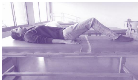
Figure 2: Isometric upper abdominals

This study was approved by the Institutional ethical committee. Subjects were recruited from the CHARUSAT University. After taking official permission from the principal of respective college students were taken as subjects of study. Prior to testing the purpose and procedure of the study were explained to the subjects. After analyzing the inclusion and exclusion criteria, each subject was asked to sign an informed consent form. After taking informed consent PAR-Q questionnaire was administered. Individuals who answered affirmatively to three or more questions were excluded. After that Canadian Standardized Test of Fitness (6 test) were performed, prior to that demonstration of six tests of fitness was given.