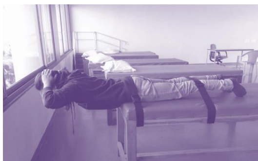
Figure 5. Isometric upper back extensors