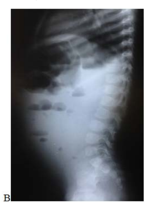
Figure 1. Thoracic-abdominal radiography with multiple air-fluid levels in the colon and mesogastrium. (A: anterior-posterior incidence, B: profile)

Thoracic-abdominal X-Ray showed the presence of multiple air-fluid levels in the colon and mesogastrium (Figure 1 A and B).