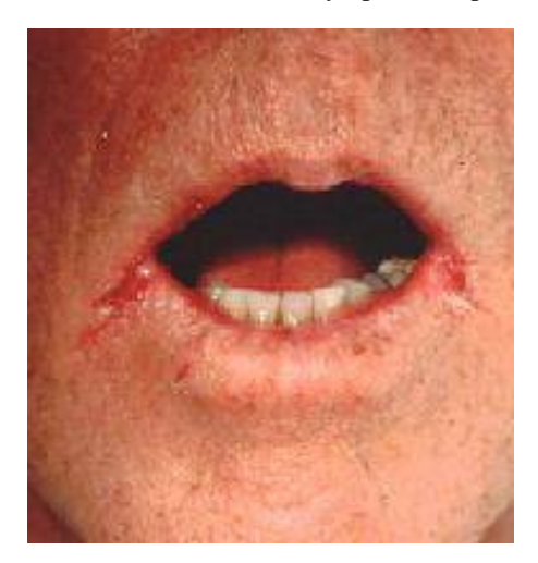
Figure 2. Physical examination of the patient

IgG tTG= 112 U / ml (normal values<10U/ml). Later, an upper gastrointestinal endoscopy with biopsy sampling of duodenal mucosa was performed. Histopathological examination confirmed the presence of gluten enteropathy (Figure 4). A positive result for Helicobacter\ Pylori (HP) was also found. The patient followed a gluten-free diet, iron supplement, antibiotic, antisecretory treatment for the gastritis and HP. Two months after starting her diet without gluten, the patient was no longer anemic (Hg = 12.9g / dl, HT = 39, 1%) and her symptoms improved.