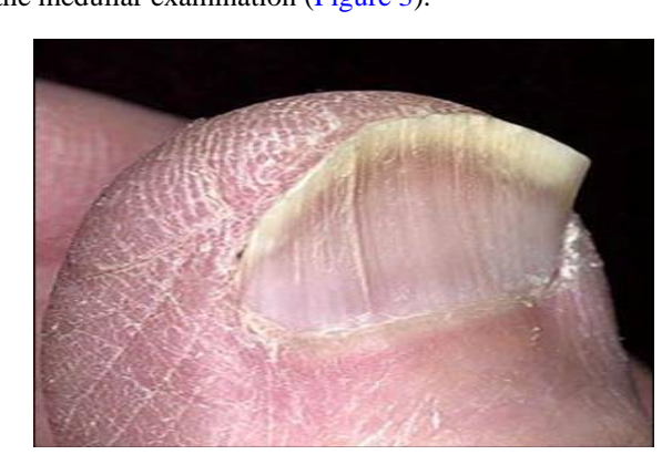
Figure 1. Physical examination of the patient

Hematologic Service with a six-month history of palpitations, asthenia, fatigue, weight loss (approximately 4 kg in 2 months), dizziness, headache and loss of appetite. Physical examination revealed pale and dry skin and mucous, brittle hair, nails exfoliation (Figure 1), angular cheilitis (Figure 2), without fever, hepatomegaly, signs of dermatitis and arthritis. Blood samples at admission revealed severe microcytic anemia (Hg = 6.6 g / dl), MCV 64,3fl, MCH= 16,1 pg. with accelerated sedimentation rate (ESR = 19-47 mm) and 35% reticulocytes. Iron studies showed iron-deficiency anemia with hypo sideremia (Fe = 7\mu g / dl), low ferritin (ferritin = 2.2 ng / ml). Red blood cells disarray with microcytic erythrocyte, isolated macrocytes, rare codocytes, rare dacrocytes, rare schizocytes, hypochromia up to anulocytes characterized the medullar examination (Figure 3).