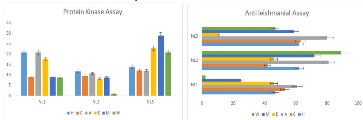
Fig 3: Protein kinase & Anti-leishmanial potential

Leishmania is a parasite which cause leishmaniasis whose prevalence is 0.7 million (700,000) to 1.2 million (1,200,000) [36] Results indicated that extracts of NL1 were highly effective against leishmaniasis. Among these extracts water W, Methanol M and Acetone A samples showed highest % mortality i.e., 88% mortality. While some low polar extracts of leaves also showed significant results. Our findings suggest that both of these plants could be a potential source of antileishmanial compounds (Figure 3).