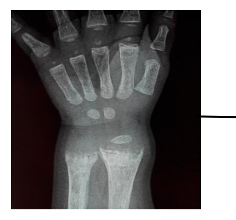
Figure: 3 x- ray showing cupping, fraying, loss of trabeculae and width of metaphysis