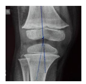
Figure: 4 Tibiofemoral Angle Measurement