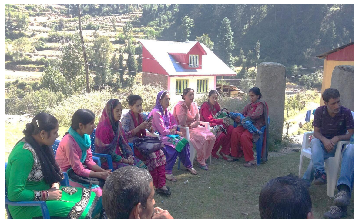
Gram Sabha attended by SHG members with District Rural Development Agency officers Regarding IPPE- 2 and MGNREGA

understand each other's viewpoints and problems. Interaction with other women has resulted in building congenial relationships and has ensured fewer conflicts. Awareness of health related issues, personal hygiene, communicable diseases, sanitation have also increased as a result of training programs and their participation in the related projects.