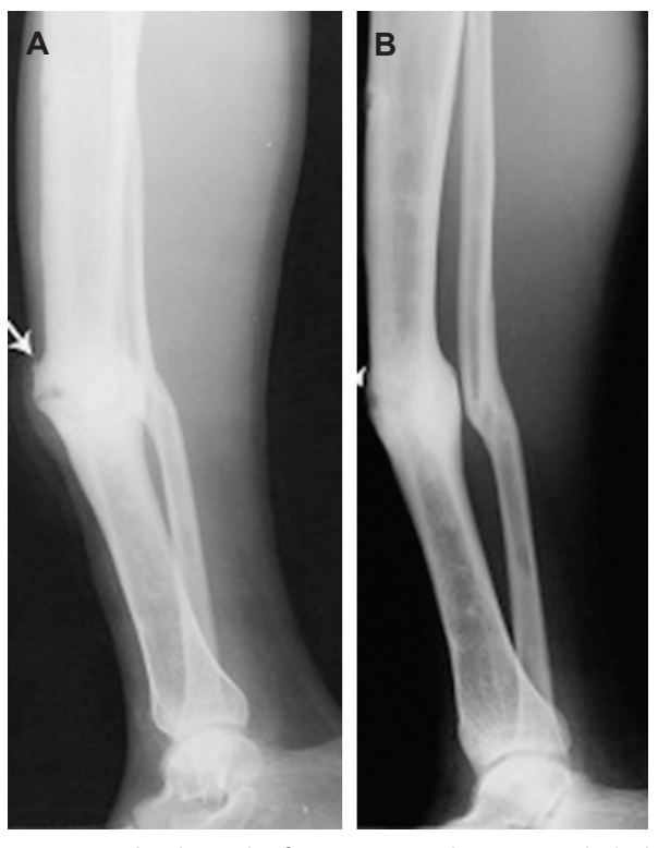
Fig.2: Lateral radiograph of a 32 years male non-united tibial fracture, arrow shows the fracture. A. Before intervention and B. 6 months after using MSCs in combination of platelet lysate product, arrow shows radiological signs of healing. MSCs; Mesenchymal stromal cells.