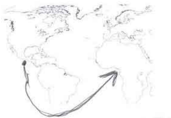
Figure 2: Example of the wrong answer on the route of eel.