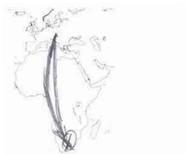
Figure 3: Example of the wrong answer on the route of storks.

The correct route of stork was drawn by 13 % of students. The storks migrate over the land, not over the seas and the oceans. The majority of routes were over the seas as it is possible to see in the figure 3. Some students finished the route of storks in North Africa.