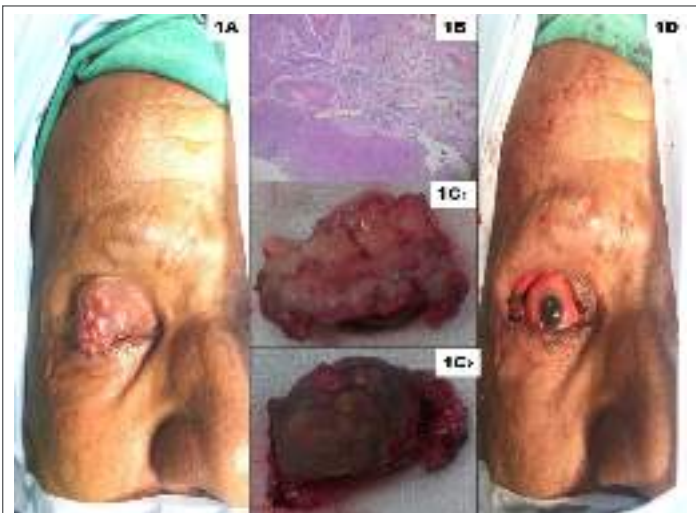
Figure 1: 1A-Patient profile showing tumor arising from the upper eyelid; 1B-Biopsy showing high grade sebaceous gland carcinoma; 1C1 and 1C2-Resected specimen showing the tumor; 1D-Defect in the eyelid after the resection of the tumor of the upper eyelid.