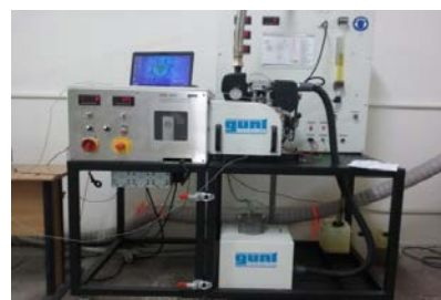
Figure 1. Gunt CT159 Modular stand

The study on the effects of biodiesel on CO and HC emissions was conducted on the Gunt CT159 Modular stand with a single cylinder engine of 2 kW, a HM 365 universal load and braking drive, which was connected to a computer with a program of data collection created for the platform and performed on the LabView core. (Fig.1) The MGT 5 type gas analyzer, together with the printer, was attached to the stand exhaust.