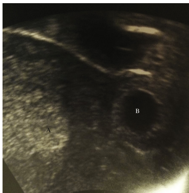
Figure 1. Transvaginal scan. A: Uterine cavity; B: Ectopic pregnancy structures in tubal stump.

abdominal pain of two days' duration, and a positive pregnancy test ( \beta -hCG level on admission = 3 046 mIU/mL and the next day 3 274 mIU/mL). On pelvic examination, the cervix was closed and the uterus was mobile and had normal size. On the transvaginal ultrasonography, uterus was empty with homogenous texture and endometrial thickness was 16.75 mm. GS without fetus was noted on the right side of the uterus (Figure 1).