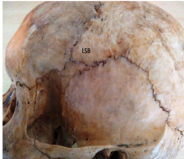
Fig. 3: Left side temporal fossa of skull shows, LSB: Left Sutural Bone.

Fig. 2: Left side temporal fossa of skull shows, LSB: Left Sutural Bone.