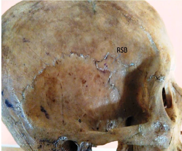
Fig. 2: Left side temporal fossa of skull shows, LSB: Left Sutural Bone.

Fig. 1: Right side temporal fossa of skull shows RSB: Right Sutural Bone.